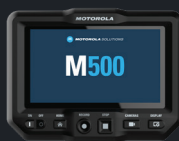
M5D CONTROL PANEL