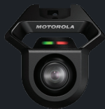
M5F FRONT CAMERA